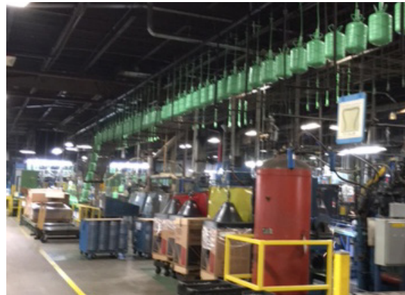
State-of-the-art equipment helps ensure superior quality.