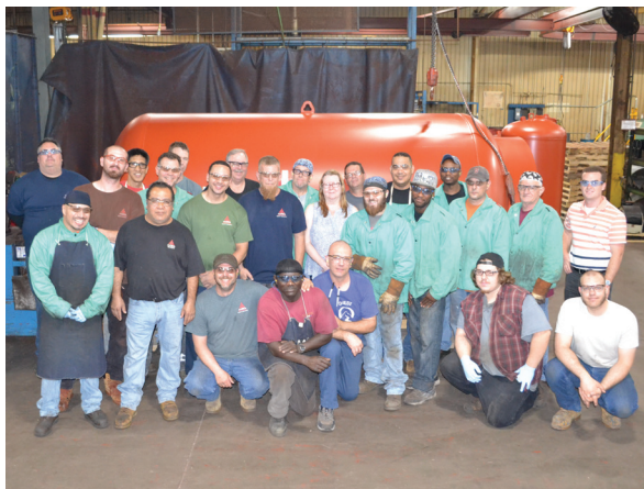
Amtrol employees take great pride in their work.

AMTROL 1400 Division Road West Warwick, RI 02893 USA T: 800.426.8765 F: 800.293.1519 www.amtrol.com