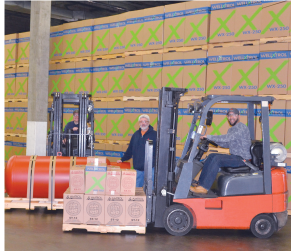
Amtrol brands are recognized around the world.

For information on open positions or to submit an application, visit http://www.amtrol.com/jobs/list.html . Amtrol is an Equal Opportunity Employer.